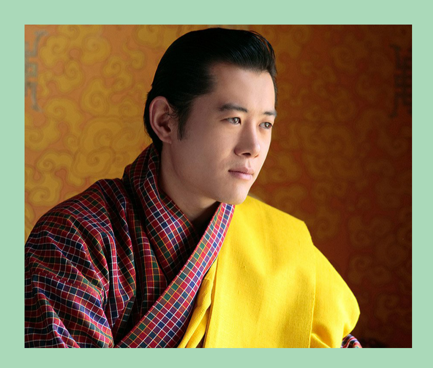
Coronation Address Changlimethang, November 7, 2008

"......as the world changes we may lose fundamental values on which rest our character as a nation and people. It is critical that we are able to recognize Bhutanese character irrespective of how far we look back into the past or into the future. The Bhutan we see is vastly different – unrecognizable even when compared to the Bhutan in the time of our first king. Yet, the character of our people and the nature of our fundamental values have remained unchanged."