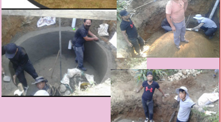
Submitted by Ozongkhag Livestock Sector