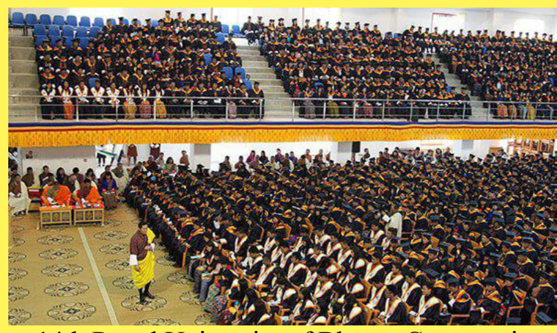
14th Royal University of Bhutan Convocation, Thimphu, 24th May, 2019

"As always, I begin by reflecting on our past. Knowledge of our past is important as it helps us to understand where we are today as a nation and perhaps also develop a sense as to where we may be headed as we look to the future."