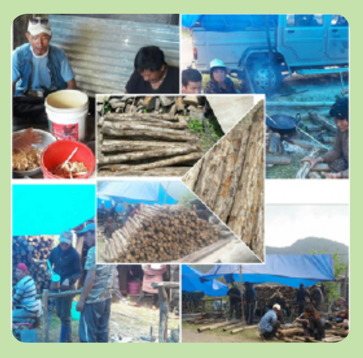
Pictorial summary of shiitake cultivation process.