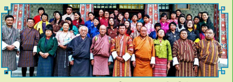
Submitted by RLDC Zhemgang